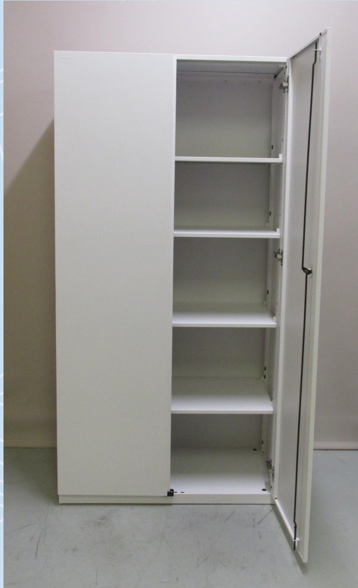
Pictured: 1800 high unit, 900 wide, 4 shelves