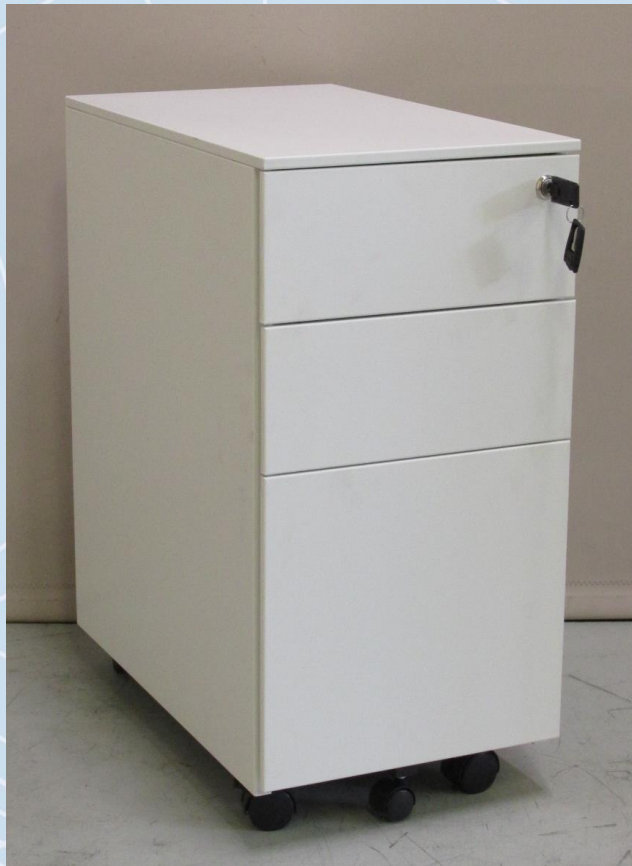
Pictured: Slimline 3 drawer