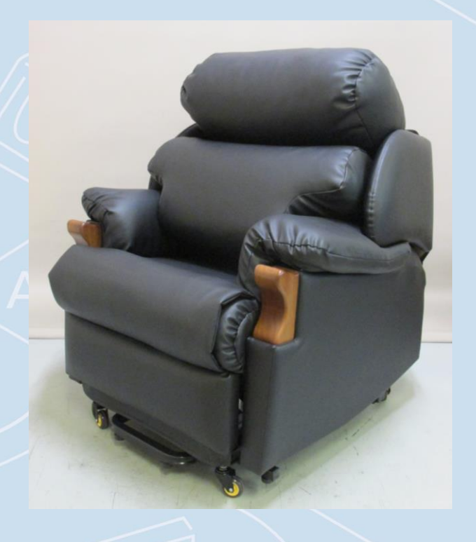
Single motor - Hudson size Mini